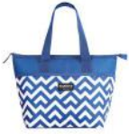
[11930064] 00066246 Essential Tote Cooler Bag (Blue Trellis) Igloo 12/CS