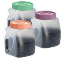
[16007098] 435 2.2L Plastic Jar (Assorted) Diadia 12/CS