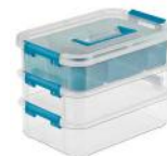
[11620191] 14138606 3 Layer Stack & Carry Handle Box & Tray (7.75" H) Sterilite 6/CS