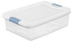
[11620154] 14968006 30L/31qt Latch Box (White) Sterilite 6/CS