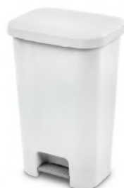
[11620119] 10698004 12 Gallon Step-On Waste Basket (White) Sterilite 4/CS