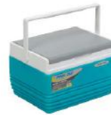
[11930093] TPX-6007 12qt Eskimo (Blue) Pinnacle 1/CS