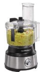
[15410327] 70730G 10 Cup Food Processor w/Bowl Scraper 450W Hamilton Beach 1/CS