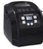
[15410401] 29982 2lb Breadmaker (Black) Hamilton Beach 1/CS