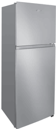
[10627541] ASB-18FWI-SS 18cft Fridge with Ice Maker (Stainless Steel) 1/CS