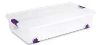
[11620188] 17611704 60qt Latch Underbed ClearView™ Wheeled Sterilite 4/CS