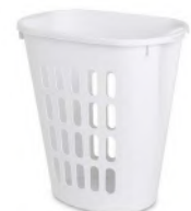
[11620126] 12568006 21" Open Laundry Hamper (White) Sterilite 6/CS