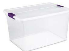
[11620193] 17571706 66qt ClearView™ Latch Box Sterilite 4/CS