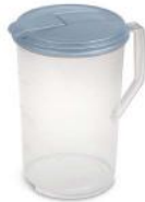
[11620103] 04880006 1 Gallon Round Pitcher Sterilite 6/CS