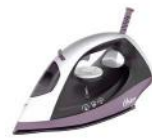
[10612537] GCSTBS6005-013 Steam Iron with Non-Stick Soleplate Oster 1/CS