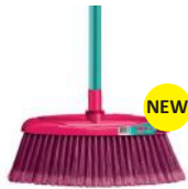
[16001634] 1632EX Novica Max Broom Bettanin 12/CS