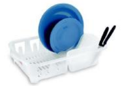
[16007095] 354CE Dish Rack Large (Clear) Sanremo Casar 6/CS