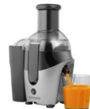
[10561603] JMBD3181 2spd Juice Extractor 500W (Gray & Black) Black+Decker 2/CS