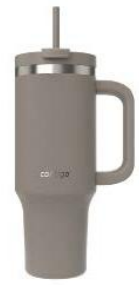
[10577853] 2204456 40oz Streeterville Tumbler (Inky) Contigo 4/CS