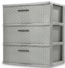
[11620179] 25306A01 3 Drawer, 24"H Wide Weave Tower (Cement) Sterilite 1/CS