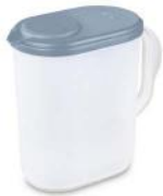
[11620104] 04900006 1 Gallon UltraSeal™ Pitcher (Sterilite 6/CS