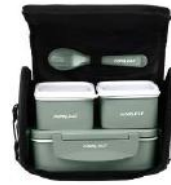
[11930145] PR-1915 Pyramid 4pc W/Bag (Green) Pinnacle 1/CS