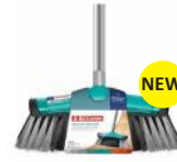
[16001003] BTN1002H Indoor Broom Bettanin 12/CS