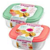
[16008614] 460/2C 3pk Container 480/1300/2500ml (Pink/Green) Vac Freezer 6/CS