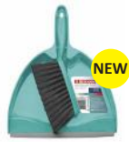
[16001200] BTN120H Dustpan & Brush Bettanin 12/CS