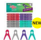
[16003507] Bt3507 Heavy Clothes Peg 12pk Esfrebom 24/CS