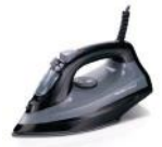
[15410208] 14105 Steam Iron w/Extra-Glide™ Soleplate (Black) Hamilton Beach 4/CS