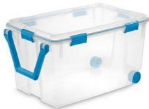
[11620194] 19434303 120qt Gasket Box Wheeled Sterilite 3/CS