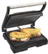
[15410644] 25440G Panini Press/Grill Proctor Silex 2/CS