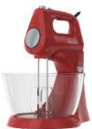
[10560565] MX9125-ORDLA Stand/Hand Mixer 250W (Red) Black+Decker 2/CS