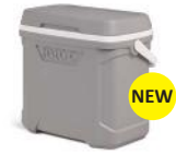
[11930321] 00050348 30qt Cooler Profile II (Grey) Igloo 2/CS