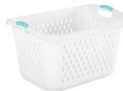
[11620151] 12038903 2.7 Bushel Laundry Hamper (White + Aqua) Sterilite 3/CS