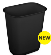
[11620200] 10469008 3 Gallon /114L Rectangle Waste Basket (Black) Sterilite 8/CS