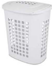
[11620171] 12218004 24", 2.3 Bushel LiftTop Laundry Hamper (White) Sterilite 4/CS