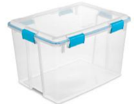
[11620146] 19384304 80qt Gasket Box (Blue) Sterilite 4/CS