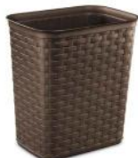
[11620113] 10346P06 3.4 Gallon Weave Waste Basket (Espresso) Sterilite 6/CS