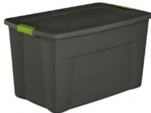
[11620170] 19453V04 35 Gallon/140qt Latch Tote (Gray) Sterilite 4/CS