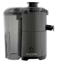
[10561223] JE2500B-LA Juice Extractor 400W (Black) Black+Decker 2/CS