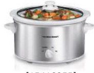
[15410355] 33140G 4qt Slow Cooker (Silver) Hamilton Beach 2/CS