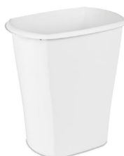
[11620118] 10538006 10 Gallon Rectangle Waste Basket (White) Sterilite 6/CS