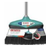
[16001643] BT1642H Novica Outdoor Broom Bettanin 12/CS