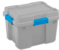
[11620166] 18316A04 20 Gallon/80qt Gasket Tote (Cement) Sterilite 4/CS