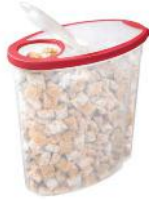
[10577609] 2184347 1.5 Gallon/24 Cup Cereal Keeper (Red) Rubbermaid 4/CS