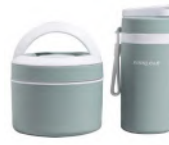
[119301367] PX-1104 Prime + Pixel (Blue) Pinnacle 1/CS