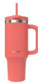
[10577852] 2204454 40oz Streeterville Tumbler (Coral) Contigo 4/CS