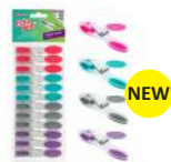
[16003503] BT3503 Rubber Clothes Peg 12pk Esfrebom 24/CS