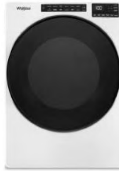
[10801525] 7MWED6605MW 23kg Front Load Electric Dryer with Steam 1/CS

Dimensions: 38.62"(H) x 27"(W) x 31.56"(D)