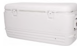
[11930070] 00044577 120qt Marine Cooler (White) Igloo 1/CS