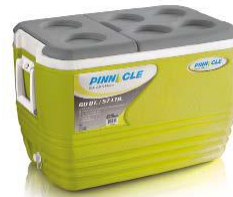
[11930127] TPX-6005G 60qt Cooler Eskimo (Lime Green) Pinnacle 1/CS