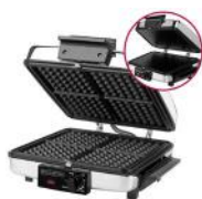
[10560309] G49TD 3 in 1 Grill Waffle/Grill/Griddle (Stainless Steel) Black+Decker 3/CS