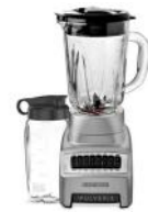
[10560287] BL1140MS Pulverix™ 12spd Blender 700W w/Glass Jar & Tumbler (Silver) Black+Decker 2/CS