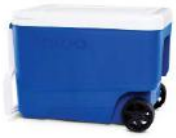
[11930043] 00034482 38qt Wheeled Cooler (Blue) Igloo 2/CS