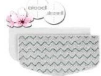
[11640140] 5938 Powerfresh Pad Kit 2pk (includes 4 Fragrance Discs) Bissell 1/CS