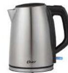
[10611830] BVSTKT673SS 1.7L Electric Kettle (Stainless Steel) Oster 1/CS