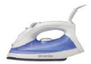
[15410201] 17201PS Non-Stick Iron w/Vertical Steam (Blue) Proctor Silex 4/CS