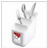
[16008010] OR45610 Plastic Cutlery Drainer (White) Ordene 6/CS