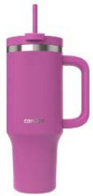
[10577849] 2201793 40oz Streeterville Tumbler (Galactic) Contigo 4/CS