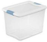
[11620153] 14958006 24L/25qt Latch Box (White) Sterilite 6/CS