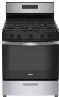
[10800058] LWF7700S 30" 5-Burner Gas Range (Silver) 1/CS