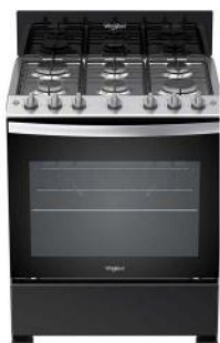
[10803015] LWFR3100B 30" 6-Burner Gas Range with Stainless Steel Top (Black) 1/CS