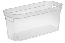
[11620130] 13288608 Narrow Storage Bin (Clear) Sterilite 8/CS