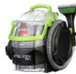
[11640126] 2505 Little Green® Pro Portable Carpet Cleaner Bissell 1/CS