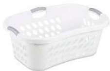
[11620124] 12108006 1.25 Bushel Ultra HipHold Laundry Basket (White) Sterilite 6/CS