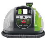
[11640132] 3369 Little Green® Portable Carpet Cleaner Bissell 1/CS