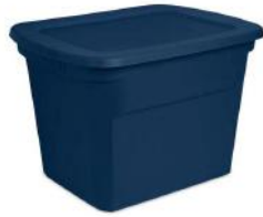
[11620162] 17317408 18 Gallon/72qt Tote (Marine Blue) Sterilite 8/CS