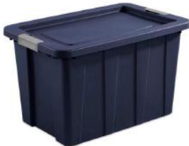
[11620158] 15278N04 30 Gallon/120qt Latch Tuff1 Tote (Indigo) Sterilite 4/CS