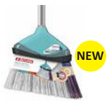
[16001693] BT1692H Angle Broom Bettanin 12/CS