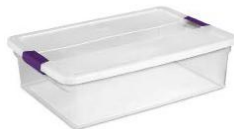
[11620189] 17551706 32qt ClearView™ Latch Box Sterilite 4/CS