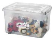
[16007510] 985 72L Storage Container Top Stock 6/CS