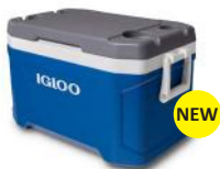
[11930317] 00050338 52qt Cooler Latitude (Meteorite Blue) Igloo 2/CS