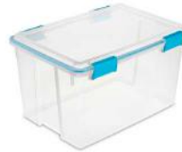
[11620145] 19344304 54qt Gasket Box (Blue) Sterilite 4/CS