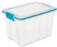
[11620143] 19324306 20qt Gasket Box (Blue) Sterilite 6/CS