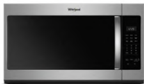
[10800236] WMH31017HZ 1.7cft Microwave Hood Combo (Stainless Steel) 1/CS

Dimensions: 17.1”(H) x 29.9”(W) x 18”(D)