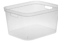
[11620129] 13268606 Tall Storage Bin (Clear) Sterilite 6/CS