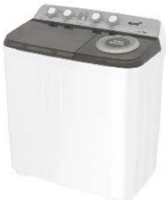
[10801203] ALD1545JE 15kg Twin Tub Washer