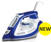
[10561700] IR3001 Ceramic Iron Steam Iron w/Auto Shut Off (Blue) Black+Decker 3/CS