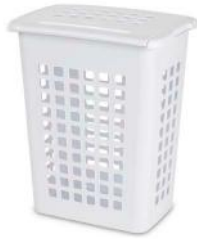
[11620150] 12238004 22", Rectangular LiftTop Laundry Hamper (White) Sterilite 4/CS