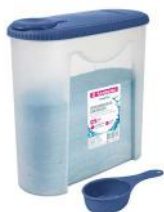
[16008502] 267 2.35L Plastic Container Sanremo Hydrus 12/CS