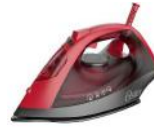
[10612040] 6051 Ceramic Steam Iron w/Vertical Steam (Red) Oster 6/CS