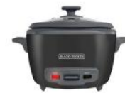
[10560167] RC514B Rice Cooker 14 Cooked Cups (Black) Black+Decker 2/CS