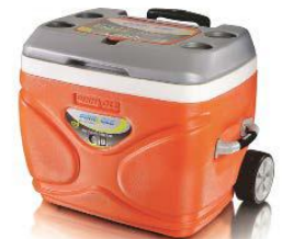
[11930086] TPX-3008 70qt Cooler Prudence Wheeled (Orange) Pinnacle 1/CS