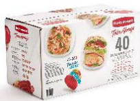
[10570334] 2165271 40pc TakeAlongs Value Pack (Ruby) Rubbermaid 2/CS