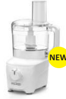
[10561105] FP4342-2WDLA 8 Cup Food Processor Black+Decker 2/CS