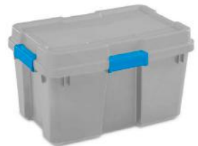
[11620167] 18336A03 30 Gallon/120qt Gasket Tote (Cement) Sterilite 3/CS