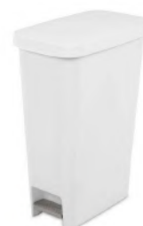
[11620195] 10588004 11 Gallon Slim Step-On Wastebasket (White) Sterilite 4/CS