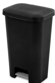
[11620120] 10699004 12 Gallon Step-On Waste Basket (Black) Sterilite 4/CS