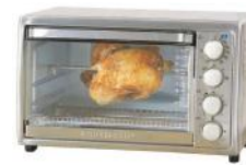
[10561152] TO4315SS-LA Air Fry Toaster Oven w/Rotisserie (Silver) Black+Decker 1/CS