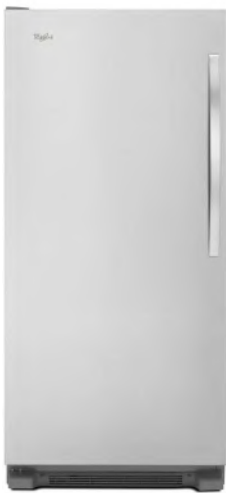
[10802520] WSZ57L18DM 18cft SideKicks® All-Freezer with Fast Freeze (Stainless Steel) 1/CS