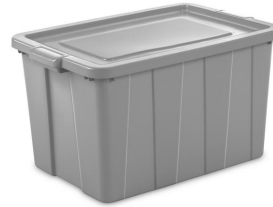
[11620160] 16796A04 30 Gallon/120qt Tuff1 Tote (Cement) Sterilite 4/CS