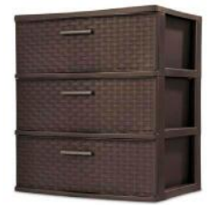
[11620180] 25306P01 3 Drawer, 24"H Wide Weave Tower (Espresso) Sterilite 1/CS