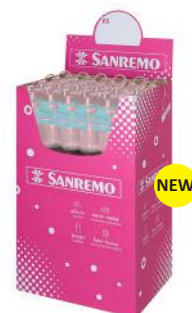
[16009404] SR91/551 Bottle Display Pink 72pc Sanremo 1/CS