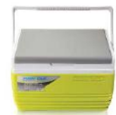
[11930119] TPX-6007 12qt Cooler Eskimo (Lime Green) Pinnacle 1/CS