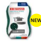
[16008448] BT48448 Multipurpose Sponge Bettanin 48/CS