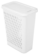
[11620196] 12268004 19", 1.75 Bushel Slim Laundry Hamper (White) Sterilite 4/CS