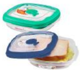
[16008611] 714/5 664ml Square Container (Green/Blue) Flor 12/CS