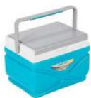
[11930019] TPX-8002 5qt Cooler Prudence (Light Blue) Pinnacle 12/CS