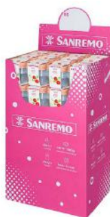
[16009401] SR122/4C55 360ml Container Display 54pc Sanremo 1/CS