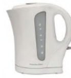
[15410372] K4090PS 1.7L Cordless Electric Kettle (White) Proctor Silex 2/CS