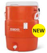
[11930319] 00042021 10 Gallon Cooler (Orange) Igloo 2/CS