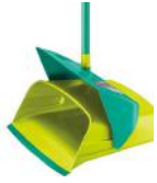
[16000140] BT140 Long Handle Dust Pan Self Closing Bettanin 6/CS