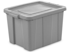
[11620159] 16786A06 18 Gallon/72qt Tuff1 Tote (Cement) Sterilite 6/CS