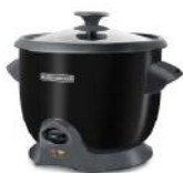
[10561227] RC620B Rice Cooker 20 Cooked Cups (Black) Black+Decker 1/CS