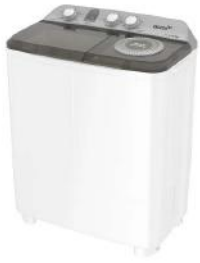
[10801200] ALD1035JE 10.1kg Twin Tub Washer