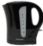
[15410371] K4097G 1.7L Cordless Electric Kettle (Black) Proctor Silex 2/CS