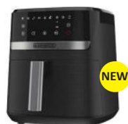
[10561155] AFBD62-1BDLA 6qt Air Fryer Black+Decker 1/CS