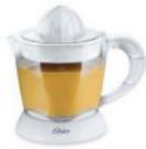
[10610699] FPSTJU407W 1L Citrus Juicer Oster 4/CS