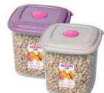
[16005001] 470-2 1.2L Square Container (Assorted Colours) Sanremo Vac Freezer 12/CS