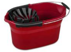
[11620123] 11295804 17.5qt Mop Bucket (Red) Sterilite 4/CS