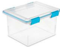
[11620144] 19334304 32qt Gasket Box (Blue) Sterilite 4/CS