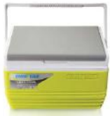
[11930128] TPX-6005G 12qt Cooler Eskimo (Lime Green) Pinnacle 1/CS