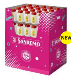
[16009406] SR751/555 250ml Bottle Display Red 360pc Sanremo 1/CS