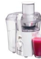
[15410351] 67702 Big Mouth Juice Extractor 800W (White) Hamilton Beach 1/CS