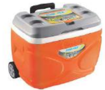
[11930087] TPX-3007 30qt Prudence Wheeled Cooler (Orange) Pinnacle 1/CS