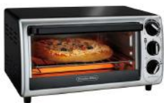
[15410437] 31122PS 4-Slice Toaster Oven (Black) Proctor Silex 1/CS