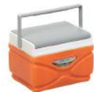
[11930089] TPX-8002 5qt Cooler Prudence (Orange) Pinnacle 1/CS