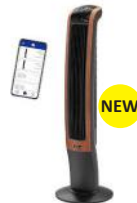
[10671080] T42905 42" Tower Fan w/Bluetooth (Black & Wood) Lasko 1/CS