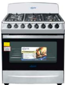
[10628304] ASB-C800-G2W 30" 6-Burner Gas Range (Stainless Steel) 1/CS