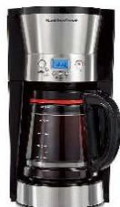
[15410512] 46895 12 Cup Coffee Maker (Stainless Steel) Hamilton Beach 1/CS