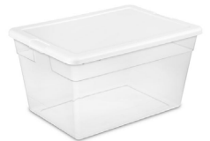
[11620183] 16598008 56qt Storage Box (White/Clear) Sterilite 8/CS