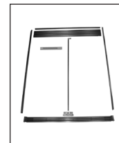
[10800904] SKT60M Full-Refrigerator and Up-Right Freezer Sidekick Trim Kit 1/CS

This product is a Factory Certified Accessory.