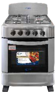
[10628323] ASB-C600-R2S 24" 4-Burner Gas Range (Stainless Steel) 1/CS