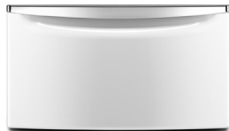
[10800260] XHPC155XW 15.5" Pedestal for Front Load Washer and Dryer with Storage (White, Chrome Handle) 1/CS

Dimensions: 38.125" (H) x 27"(W) x 31"(D)