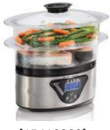
[15410309] 3753OZ 5.5qt Two Tier Food Steamer Hamilton Beach 1/CS