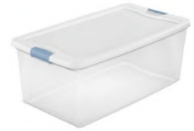
[11620177] 14998004 100L/106qt Latch Box (White) Sterilite 4/CS