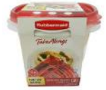
[10571609] 2184982 7 Cup TakeAlongs Deep Square (Ruby)(2pk) Rubbermaid 4/CS