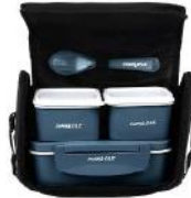
[11930106] PR-1915 Pyramid 4pc W/Bag (Blue) Pinnacle 1/CS