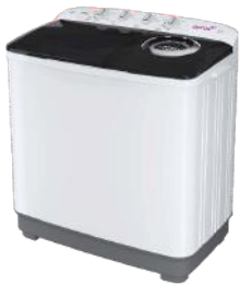
[10801202] ALD1335JE 13kg Twin Tub Washer