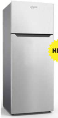
[10627542] ASB-14.6FW12-SS 14.6cft Fridge (Stainless Steel) 1/CS