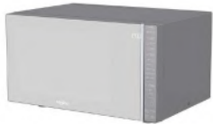
[10804031] WM1811D 1.1cft Microwave (Silver) 1/CS

Dimensions: 11.8”(H) x 21.2”(W) x 15.7”(D)