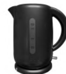
[10611837] BVSTKT3101 1.7L Electric Kettle (Black) Oster 1/CS