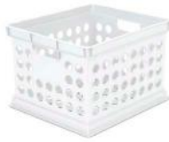
[11620172] 16940806 Storage Crate, 10.5\"/>