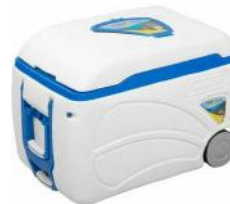
[11930140] TPX-5003 47L Cooler Voyager Wheeled (White & Blue) Pinnacle 1/CS