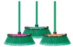
[16001622] 1622 Easy Broom w/Handle Bettanin 12/CS