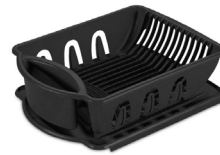
[11620106] 06219006 17" Dish Drainer Set, 2pc (Black) Sterilite 6/CS