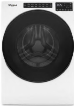
[10801025] 7MWF5605MW 21kg Front Load Washer with Quick Cycle 1/CS