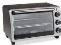
[10560078] TO1950SBD 6-Slice Convection Toaster Oven (Black) Black+Decker 1/CS