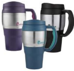
[10577589] 1953408 20oz Travel Mug Vacuum Insulated Stainless Steel (Assorted) Bubba 4/CS