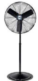
[10670008] 3135 30" Industrial Oscillating Pedestal Fan Air King 1/CS