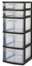
[11620175] 28959002 5 Drawer, 31.75"H Tower (Clear/Black) Sterilite 2/CS