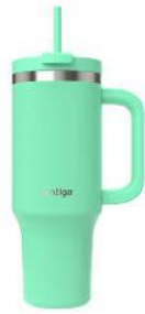
[10577850] 2201794 40oz Streeterville Tumbler (Reef) Contigo 4/CS