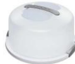
[11620100] 02008004 12" Cake Server Sterilite 4/CS