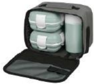
[11930105] PO1312 4pc Paloma Lunchkit (Green) Pinnacle 1/CS