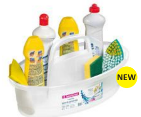
[16007093] 238 Plastic Cleaning Basket (Clear) Sanremo 6/CS