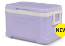
[11930315] 00050611 50qt Cooler Profile II (Lilac) Igloo 2/CS