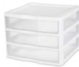
[11620186] 20938003 3 Drawer, 10.6" H ClearView™ Organizer (Clear) Sterilite 6/CS