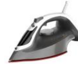
[10612045] GCSTAC6901-013 Steam Iron w/Aeroceramic Soleplate (Gray) Oster 6/CS