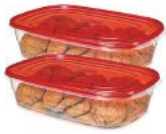
[10571633] 2184960 1 Gallon (16 Cup) TakeAlongs Rectangle (2pk) Rubbermaid 2/CS