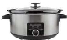
[10561211] SC2007S 7qt Slow Cooker Oval Shape (Stainless Steel) Black+Decker 2/CS