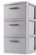
[11620173] 26306A02 3 Drawer, 24"H Weave Tower (Cement) Sterilite 2/CS