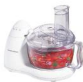
[15410324] 70450 8 Cup Food Processor 300W (White) Hamilton Beach 1/CS