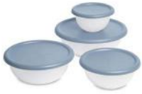
[11620109] 07470006 8pc Covered Bowl Set (1.5qt, 2.5qt, 4 & 5.5 Quart bowls w/Lids) (Blue) Sterilite 6/CS