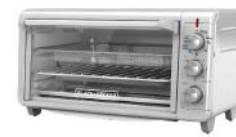
[10561150] TO3265XSS-LA Air Fry Toaster Oven 1500W w/9"x13" Tray Black+Decker 1/CS