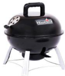
[10700230] 13301719 14" Portable Table Top Kettle Charcoal Grill Char-Broil 1/CS