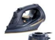
[10612533] GCSTCC5000 2-in-1 Cordless Steam Iron with Ceramic Soleplate Oster 1/CS