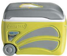
[11930118] 47qt Cooler Proxon Wheeled (Lime Green) Pinnacle 1/CS