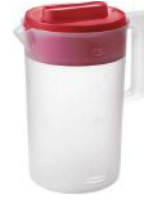
[10570958] 2122590 1 Gallon / 4.8qt Simply Pour Pitcher (Red) Rubbermaid 2/CS