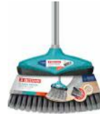
[16000869] BT1672H Original Broom w/Handle Bettanin 15/CS