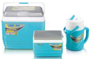
[11930083] TPX-7007 3pc Set Primero w/25qt, 5qt & 2L (Light Blue) Pinnacle 1/CS