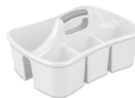
[11620198] 15888006 Divided Ultra Caddy (White) Sterilite 6/CS