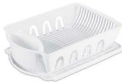
[11620641] 06418006 21" Large Dish Drainer Set, 2pc (White) Sterilite 6/CS