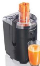
[15410389] 67500G Compact Juice Extractor 400W (Black) Hamilton Beach 2/CS