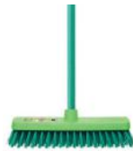
[16001182] 1182 Scrub Broom Bettanin 12/CS