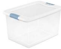
[11620176] 14978006 61L /64qt Latch Box (White) Sterilite 6/CS