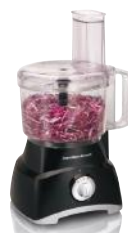
[15410322] 70740G 8 Cup Food Processor 450W (Black) Hamilton Beach 1/CS