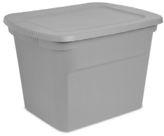
[11620161] 17316A08 18 Gallon/72qt Tote (Cement) Sterilite 8/CS