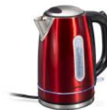
[15410556] 41060 1.7L Kettle w/LED (Red) Hamilton Beach 2/CS