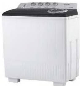
[10801206] ALD1945JE 19kg Twin Tub Washer