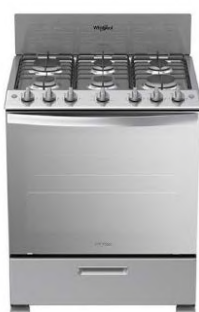
[10803018] LWFR3200D 30" 6-Burner Gas Range with Stainless Steel Top (Silver) 1/CS