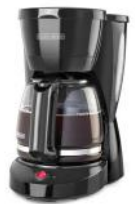
[10561312] CM0941B 12 Cup Coffee Maker Programmable (Black) Black+Decker 1/CS