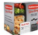
[10570358] 2117366 30pc Meal Prep Set Rubbermaid 2/CS