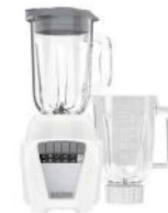
[10560322] BL0876-3WDLA 8spd Blender w/ 2 Jars Glass & Plastic (White) Black+Decker 1/CS