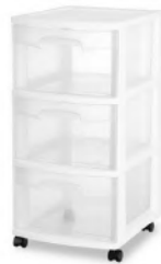
[11620181] 28308002 3 Drawer, 26"H Cart Wheeled (White/Clear) Sterilite 2/CS