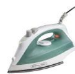
[15410212] 17291PS Non-Stick Iron Lightweight (Green) Proctor Silex 4/CS