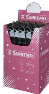
[16009402] SR91/555 Bottle Display Black 72pc Sanremo 1/CS