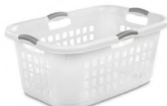
[11620152] 12168006 2 Bushel Ultra Laundry Basket (White) Sterilite 6/CS