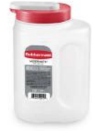
[10570959] 2185003 2qt Mixermate Pitcher Rubbermaid 2/CS