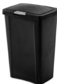
[11620116] 10459004 13 Gallon TouchTop™ Waste Basket (Black) Sterilite 4/CS