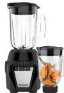
[10560327] BL0876-3BDLA 8spd Blender w/2 Jars, Glass & Plastic 700W (Black) Black+Decker 2/CS