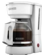
[10561311] CM0916W 12 Cup Coffee Maker w/Permanent Filter (White) Black+Decker 2/CS