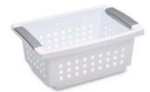
[11620105] 16608008 Small Stacking Basket (White) Sterilite 8/CS