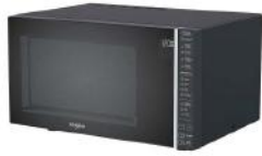
[10804030] WM1811B 1.1cft Microwave (Black) 1/CS

Dimensions: 11.8”(H) x 21.2”(W) x 15.7”(D)