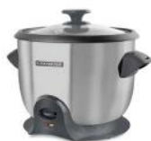
[10561228] RC620SS 20 Cooked Cups Rice Cooker (Stainless Steel) Black+Decker 2/CS