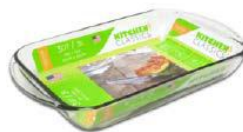
[11509502] 67526 3qt Baking Dish Kitchen Classics 6/CS