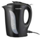
[15410365] K2071G 1L Cordless Electric Kettle (Black) Proctor Silex 2/CS