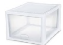
[11620148] 23108004 27qt Stacking Drawer (White) Sterilite 4/CS