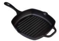
[11505295] SKL-200 10"x10" Grill Pan Cast Iron Seasoned Victoria 4/CS