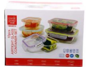
[11509080] CPEL-159 10pc Container Set Glass Cook Prep Eat 4/CS