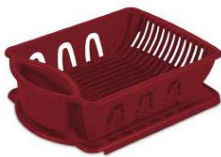
[11620190] 06215806 17" 2pc Ultra Sink Set (Red) Sterilite 6/CS