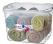
[16008251] SR981 80L Storage Container Flex 6/CS