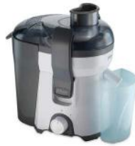
[10610695] JE316W Juice Extractor Oster 1/CS