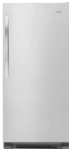
[10802040] WSR57R18DM 18cft SideKicks® All-Refrigerator with LED Lighting (Stainless Steel) 1/CS

Dimensions: 66.25"(H) x 30.25"(W) x 31.25"(D)