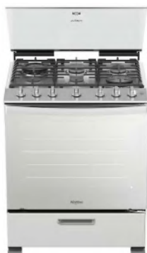
[10803060] LWFR7200S 30" 6-Burner Self-Cleaning Gas Range (Stainless Steel) 1/CS

Dimensions: 28.75"(H) x 27"(W) x 26.38"(D)