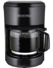
[15410461] 48351PS 10 Cup Coffee Maker (Black) Proctor Silex 2/CS