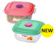
[16006546] 450/2 480ml Square Container (Pink/Green) Sanremo 12/CS