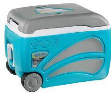
[11930117] TPX-6001 47qt Cooler Proxon Wheeled (Light Blue) Pinnacle 1/CS