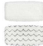
[11640141] 1252 Microfiber Steam Mop Pad Kit for Symphony™ Steam Mops (6pk) Bissell 2/CS