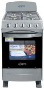
[10628301] ASB-C500-G2S 20" 4-Burner Gas Range (Stainless Steel) 1/CS