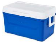
[11930051] 00050061 48qt Cooler Laguna (Blue) Igloo 1/CS