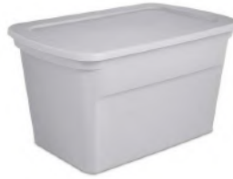
[11620163] 17366A06 30 Gallon/120qt Tote (Cement) Sterilite 6/CS