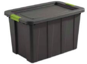
[11620157] 15273V04 30 Gallon/120qt Latch Tuff1 Tote (Gray) Sterilite 4/CS