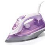
[15410206] 14100 Steam Iron w/Extra-Glide™ Soleplate (Purple) Hamilton Beach 4/CS