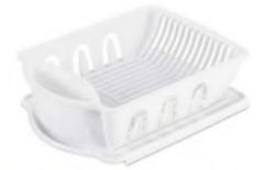
[11620621] 06218006 17" Dish Drainer Set, 2pc (White) Sterilite 6/CS