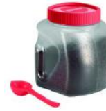
[16007099] 435/3 2.2L Plastic Jar w/Measuring Spoon (Red) Diadia 12/CS