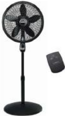
[10670106] 1843 18" Pedestal Fan w/Remote (Black) Lasko 1/CS