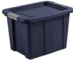
[11620156] 15258N06 18 Gallon/72qt Latch Tuff1 Tote (Indigo) Sterilite 6/CS