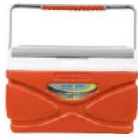
[11930088] TPX- 8001 12qt Prudence (Orange) Pinnacle 1/CS