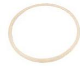
[10569994] 9LT Pressure Cooker Gasket 26cm Genie