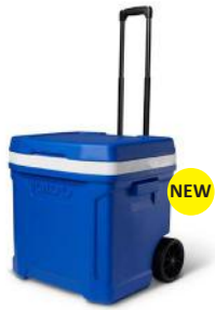
[11930311] 00034679 60qt Wheeled Cooler Profile II (Majestic Blue) Igloo 2/CS