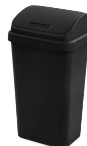
[11620122] 10899004 49lt / 13 Gallon Swing Waste Basket (Black) Sterilite 4/CS