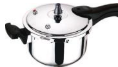
[10569050] ASB-9LSSP 9L Pressure Cooker (Stainless Steel) Genie 4/CS