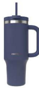
[10577851] 2204453 40oz Streeterville Tumbler (Indigo) Contigo 4/CS