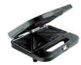
[10610668] 2885 Sandwich Maker (Black) Oster 6/CS