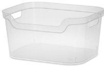
[11620133] 13368606 Large Open Bin (Clear) Sterilite 6/CS