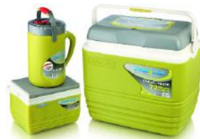
[11930084] TPX-7005 3pc Set Primero w/32qt, 5qt & 2.5L (Lime Green) Pinnacle 1/CS