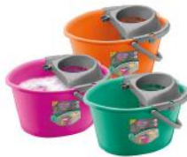
[16001384] 1384 14L Novica Mop Bucket (Assorted) Bettanin 6/CS