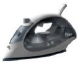
[10612030] GCSTBS5001 Compact Steam & Spray Iron (Fog Blue) Oster 10/CS