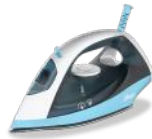
[10612536] GCSTBS6004 Non Stick Steam Iron (Light Blue) Oster 10/CS