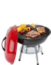
[10660380] BBQ-R14R 14" Round Grill (Red) Alpine Cuisine 4/CS