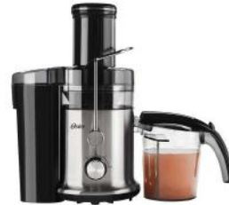
[10610705] JE320S Juice Extractor (Stainless Steel) Oster 2/CS