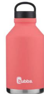
[10577546] 2163892 64oz Growler Wide Mouth Bottle (Red) Bubba 4/CS