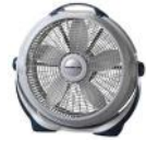
[10670013] 3300 20" Pivoting Floor Fan Wind Machine (White) Lasko 1/CS