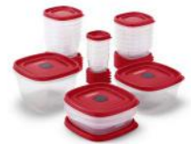
[10570344] 2063704 42pc Easy Find Lid Set w/4 Vented Lids Rubbermaid 1/CS