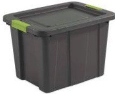
[11620155] 15253V06 18 Gallon/72qt Latch Tuff1 Tote (Gray) Sterilite 6/CS