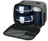
[11930104] PO1312 4pc Paloma Lunchkit (Blue) Pinnacle 1/CS