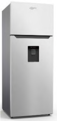
[10627540] ASB-15FWI-SS 14.6cft Fridge w/Dispenser (Stainless Steel) 1/CS