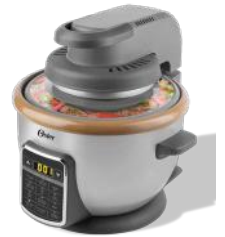
[10610907] CKSTRCAF22-013 10-in-1 Air Fryer 12 Cup Rice Cooker Oster 2/CS