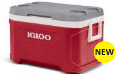
[11930316] 00050340 52qt Cooler Latitude (Meteorite Red) Igloo 2/CS