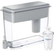
[10483051] 35302/35034/36178 18 Cup Ultramax Dispenser Brita 2/CS