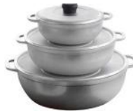
[11505325] R200-CALDERO-22 3pc Caldero Set 18/22/28cm Imusa 1/CS