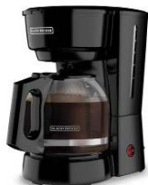
[10561601] CM0916B 12 Cup Coffee Maker w/Permanent Filter (Black) Black+Decker 4/CS