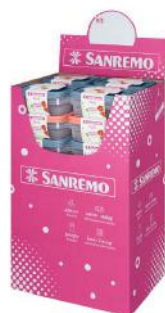
[16009400] SR165/7C55 780ml Container Display 32pc Sanremo 1/CS