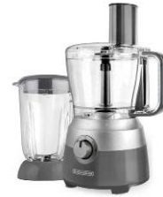
[10561104] FP5501 2-in-1 10 Cup Food Processor & Glass Jar Blender Black+Decker 1/CS