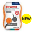
[16008648] BT48648 Multipurpose Sponge (Orange) Bettanin 48/CS