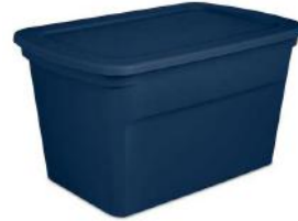
[11620165] 17367406 30 Gallon/120qt Tote (Marine Blue) Sterilite 6/CS