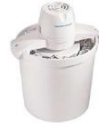
[15410407] 68330N 4qt Ice Cream Maker Automatic Hamilton Beach 2/CS