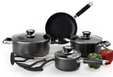
[10660357] AG-S10A 10pc Aluminum Non-Stick Cookware Set (Grey) Alpine Cuisine 6/CS