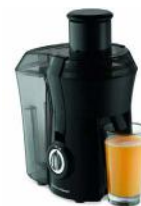
[15410358] 67601 Big Mouth Juice Extractor 800W (Black) Hamilton Beach 1/CS