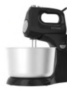
[10560568] MX9125-1BDLA 2-in-1 Hand & Stand Mixer 250W (Black) Black+Decker 3/CS