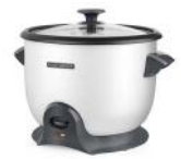
[10561226] RC620W 20 Cooked Cups Rice Cooker (White) Black+Decker 1/CS