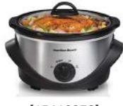
[15410378] 33141 4qt Slow Cooker (Black & Chrome) Hamilton Beach 2/CS