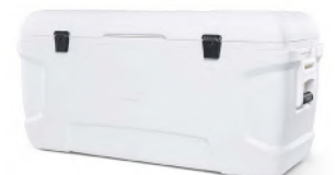
[11930073] 00050074 150qt Marine Cooler (White) Igloo 1/CS