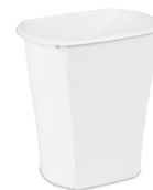
[11620187] 10518006 3 Gallon Rectangle Waste Basket (White) Sterilite 4/CS