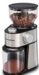
[15410509] 80385 2-14 Cup Burr Coffee Grinder with 18 Grind Settings Hamilton Beach 1/CS