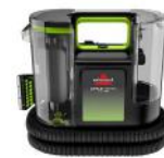
[11640019] 3857 Little Green® Max Pet Portable Carpet Cleaner Bissell 1/CS