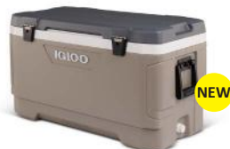
[11930320] 00050535 100qt Cooler Maxcold Latitude (Sandstone) Igloo 2/CS