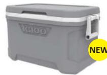
[11930314] 00050354 50qt Cooler Profile II (Grey) Igloo 2/CS