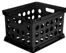
[11620184] 16939006 File Crate, 10.625\"/>