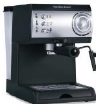
[15410753] 40715 Espresso Maker Hamilton Beach 1/CS